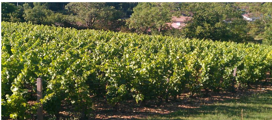
Solutr  and Vergisson.

The 26 hectares of the estate are shared between a mosaic of over 150 different plots of vines that are part of the "Grand Site de France" of Solutr  – Pouilly – Vergisson. The vines, with an average age of 40 years old, are exclusively of the Chardonnay grape variety. Most of these plots face the rising sun on gentle slopes that extend from the eastern faces of